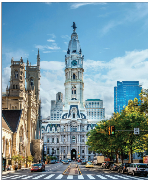
Tour Philadelphia, the birthplace of American independence