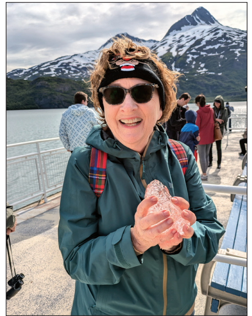
CTD traveler posing with Alaskan ice

Cruise the ice-studded fjords of this national treasure for a full eight hours as a Park Service Ranger narrates on board the ship. Alaska's Inside Passage is a protected network of waterways that wind through glacier-cut fjords and lush temperate rain forests along