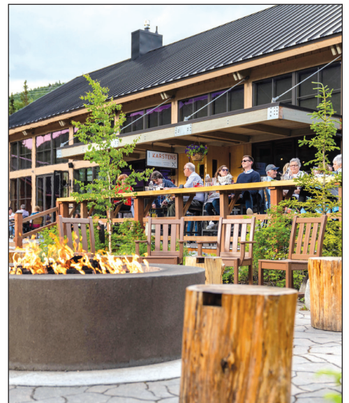
Stay at the Denali Lodge Resort