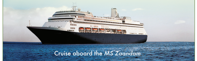
Cruise aboard the MS Zaandam

The National Parks restrict access to Glacier Bay, only allowing a few ships per day with access only granted to certain cruise lines. With more cruises sailing to Glacier Bay National Park than any other cruise line, Holland America's passengers receive privileged park access. Rangers will come aboard our vessel bringing a mobile visitor's center right to our ship! The park staff are extremely passionate about creating an enriching memorable experience for our travelers.