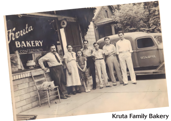
Kruta Family Bakery