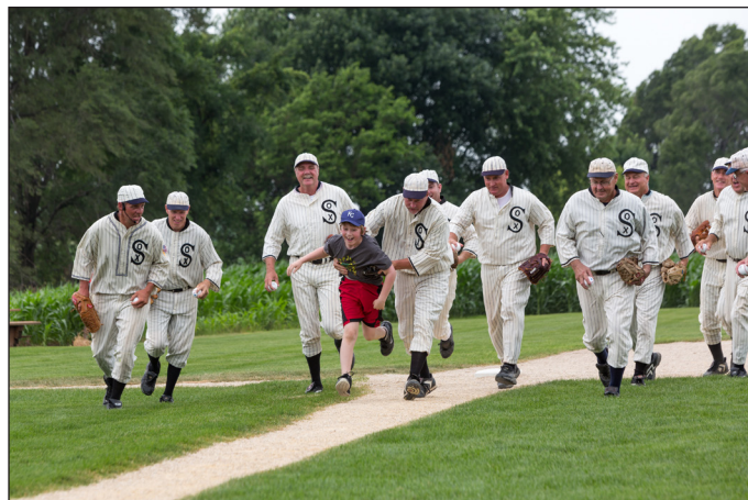
Field of Dreams