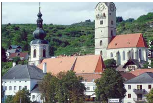
Krems an der Donau, Gateway to the Wachau