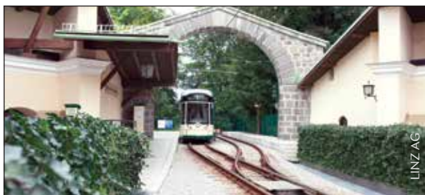
Pöstlingbergbahn Mountain Rail

This morning, we bid farewell to the ship and her wonderful crew and transfer to the beautiful Czech Republic. We'll experience the unique medieval flavor of Český Krumlov, known for its charming pedestrian walkways and stunning castle fortress high above town. Later, our scenic drive ends in Prague. B, L, D