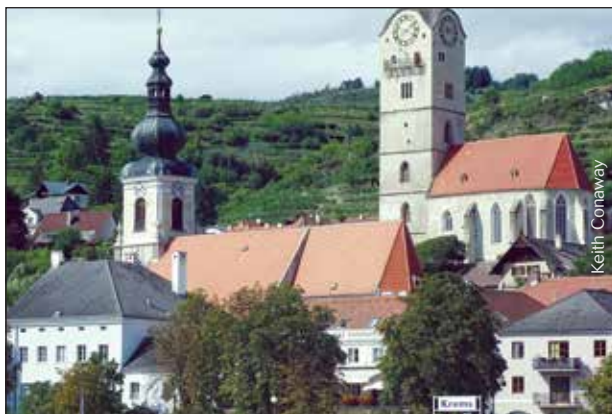
Krems an der Donau, Gateway to the Wachau