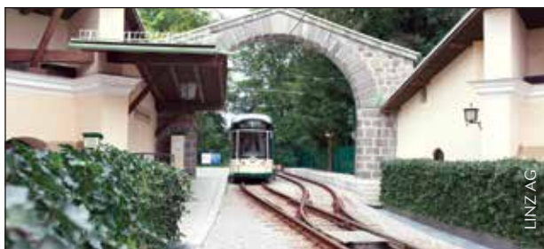
Pöstlingbergbahn Mountain Rail

This morning, we bid farewell to the ship and her wonderful crew and transfer to the beautiful Czech Republic. We'll experience the unique medieval flavor of Český Krumlov, known for its charming pedestrian walkways and stunning castle fortress high above town. Later, our scenic drive ends in Prague. B, L, D