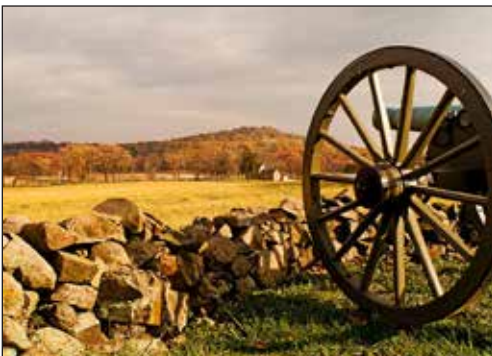
See the stories of America's birth, struggles, and reconciliation brought to life!

Unique Discovery Illuminates Our Nation's Birth, Battles and Perseverance