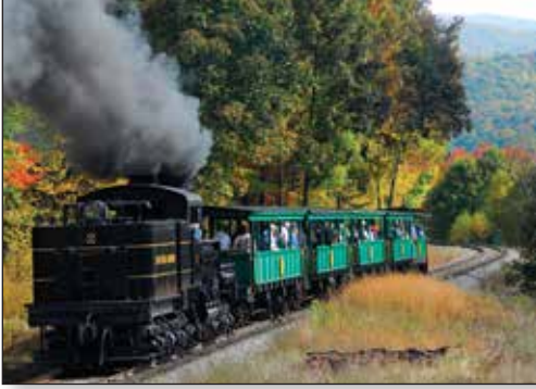
Steam through West Virginia's scenic landscapes.

All aboard! Relive the heyday of the Iron Horse aboard several vintage steam and diesel trains. Ride an old-fashioned logging train, wind through remote wilderness and canyons on the New Tygart Flyer, take a narrated excursion on the Potomac Eagle past historic farms and lush mountain greenery, and unwind on a steam-powered train in scenic Western Maryland. Get your fill of foot-stompin' mountain music at the American Mountain Theater and explore underground passages at Beckley Exhibition Coal Mine on an authentic "man car".