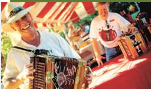
"Let the good times roll!"

"Southern Hospitality" is just what you'll find in this exploration of the Gulf region's diverse cultural, culinary and natural attractions. Savor delectable meals in the Big Easy, explore historical life in plantation towns along the Mississippi, meet bayou country locals who earn a living from land and sea, and laissez les bons temps rouler in a thrilling excursion into the heart of Cajun country!