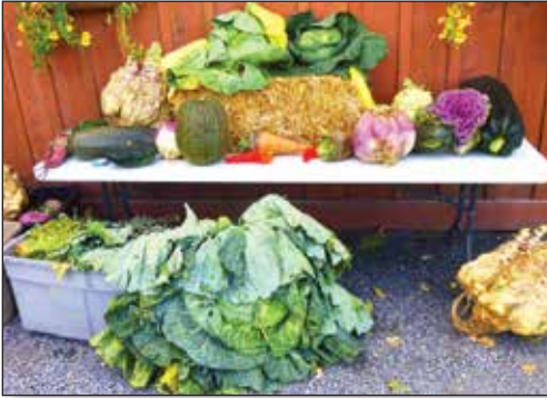
Discover Agricultural Secrets of the "Land of the Midnight Sun"

Explore Alaska's Farms, Husbandry, Sea Life and Environment