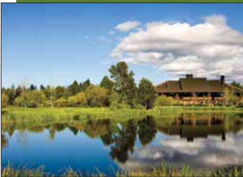
Spend 3 nights at luxurious Sunriver Resort, at the base of the Cascades.

A northwestern adventure from Pacific coast to the Columbia River Gorge, the high desert to Crater Lake. Meet skilled growers of hazelnuts and fruit. View stunning mountain vistas, from Mt. Bachelor to famed Mt. Hood. Lunch at the spectacular Timberline Lodge, a national landmark built by the Civilian Conservation Corps and WPA, whale-watch with an ocean naturalist, cruise the Columbia River Gorge, and hear ocean waves crashing against the shore in historic Newport.