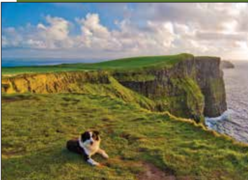
Discover the colorful history and proud traditions of the Emerald Isle.

From traditional food, music and dancing to breathtaking scenery and bustling cities, this route through Ireland and Northern Ireland is nothing short of magical. Visit the dramatic Cliffs of Moher, Giant's Causeway, and bustling capitals of Dublin and Belfast. Relive the days of colorful chieftains at historic Blarney Castle, and meet folks proud to share their traditions, from baking and distilling to glass-cutting and woolcraft. It's an unforgettable introduction to the Emerald Isle—high and low, north and south, urban and pastoral, but always uniquely Irish.